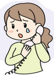
How to call for help

Disaster prevention goods will be presented !